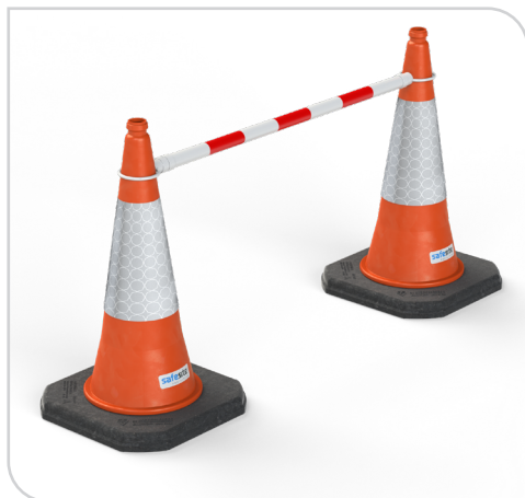
Cone poles in use

With a 360-degree 100mm loop and adjustable length of 1.1m to 2.2m, the telescopic cone pole can adapt to the alignment of any cones, providing a quick and flexible temporary barrier solution. SafeSite can supply both cones and telescopic cone poles, offering a comprehensive and efficient barrier solution at a cost-effective price.