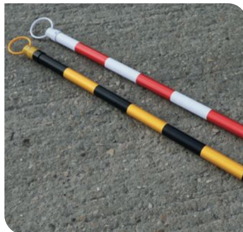
Different colours available